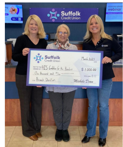
Suffolk Credit Union of Sayville contributing a generous donation to the HIS Coalition.