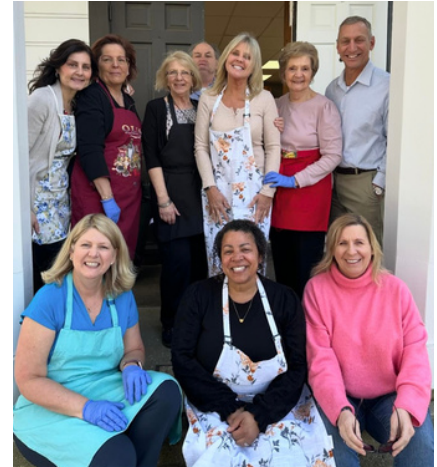
HIS Coalition feeding the community by providing an Easter Dinner with the support of local businesses.

Visit this extraordinary group on Facebook and Instagram or use the QR code for volunteer opportunities, to learn more about their initiatives, and to see how your support can help to assist neighbors in need.