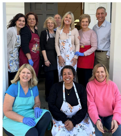
HIS Coalition feeding the community by providing an Easter Dinner with the support of local businesses.

Visit this extraordinary group on Facebook and Instagram or use the QR code for volunteer opportunities, to learn more about their initiatives, and to and see how your support can help to assist neighbors in need.