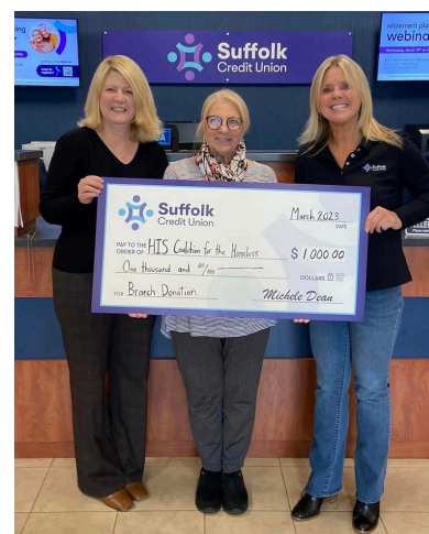
Suffolk Credit Union of Sayville contributing a generous donation to the HIS Coalition.