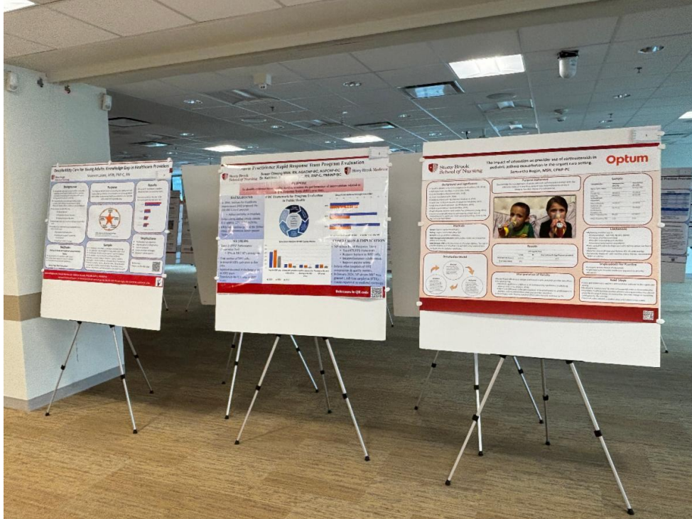
Behind the scenes of the poster presentations