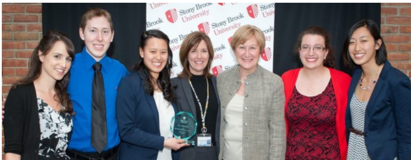
of SBSNA Board of Directors at the NSANYS 63rd annual convention at Hotel Pennsylvania in New York City.