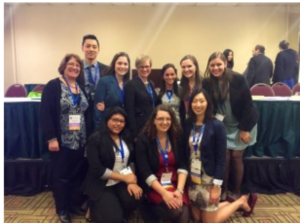
of SBSNA Board of Directors at the NSANYS 63 rd annual convention at the Hotel Pennsylvania in New York City.

that SBSNA continues to be a strong force within the School of Nursing in years to come.