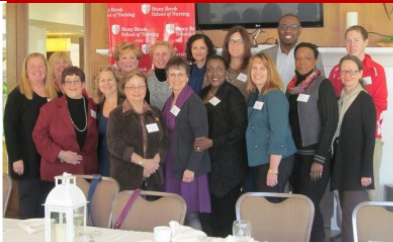
The First DNP cohort celebrated their 5 year anniversary in the Hilton at Stony Brook University.

Life as a student in mid-life, as for most of my DNP cohort, was arduous, juggling a demanding professional life, nurturing family while at the same time meeting rigorous challenges of the DNP program. I can say for myself and venture to say for my DNP cohort that while we felt proud of this achievement at graduation we were at the very beginning in developing, defining our professional identities and