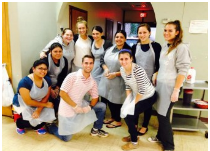
at Trinity Evangelical's soup kitchen.

On February 21 st our board of directors as well as twenty-one of our members attended The Nursing Student's Association of New York State's (NSANYS) 63 rd annual convention in New York City. It was an extremely valuable and inspiring day full of guest lecturers, NCLEX review, forums, exhibitors, resume review, and networking. We are looking forward to attending the National Student Nurses' Association 63 rd annual convention in Phoenix, AZ this April!